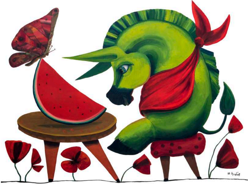
Oil on canvas, 100 x 125 cm