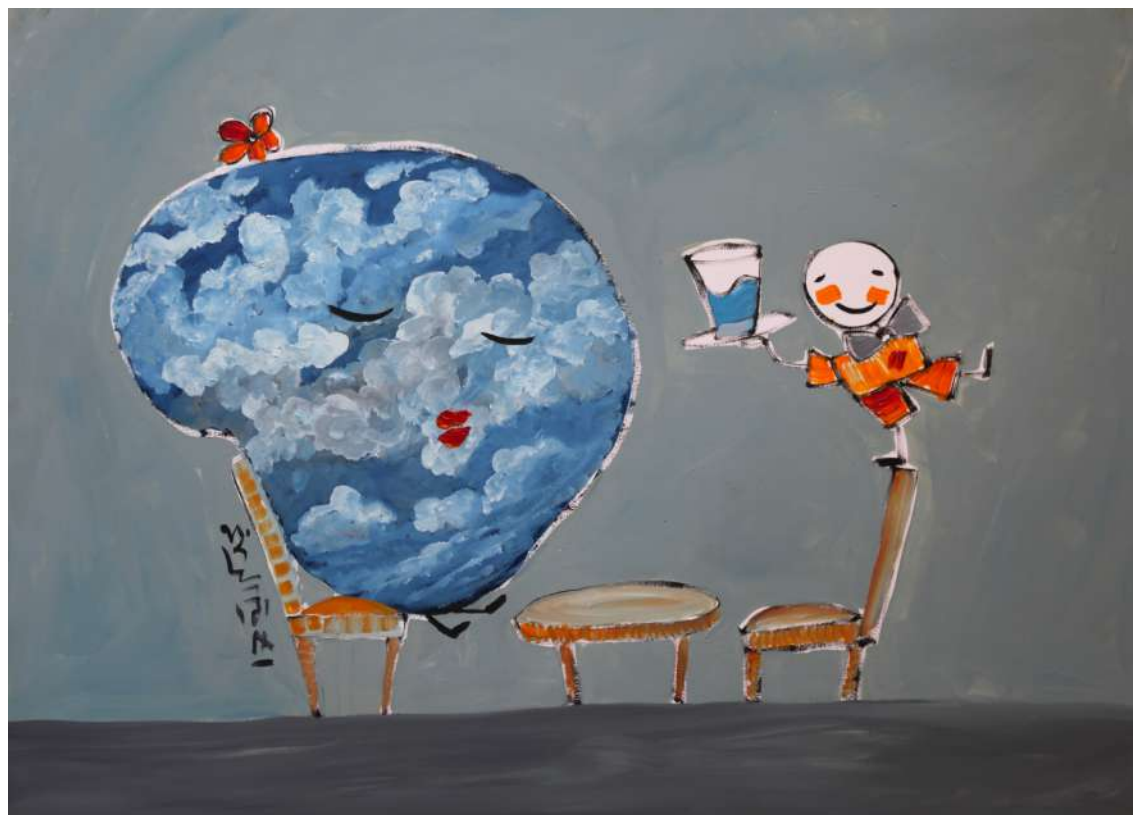
Oil on paper, 60 x 90 cm